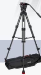
System FSB 6 Mk II 75/2 AL MS 0473AM