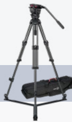
System FSB 6 Mk II 75/2 CF GS 0471CM