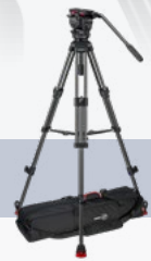
System FSB 6 Mk II 75/2 CF MS 0473CM