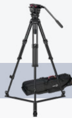
System FSB 6 Mk II 75/2 AL GS 0471AM