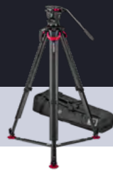
System aktiv10 flowtech100 GS S2072S-FTGS