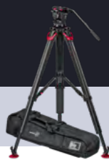
System aktiv10 flowtech100 MS S2072S-FTMS