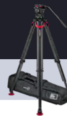
System aktiv10 flowtech100 S2072S-FT