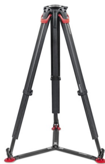
Tripod flowtech® 100 GS