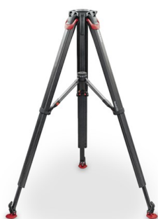
Tripod flowtech® 100 MS