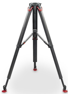
Tripod flowtech® 100 MS