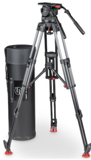
System 25 EFP 2 MCF