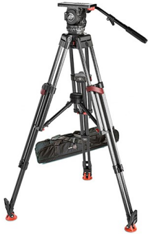
System 20 S1 SL HD MCF