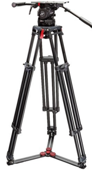
System Cine 30