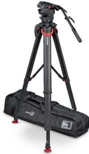
System Cine 7+7 FT MS