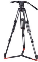
System 7+7 HD MCF