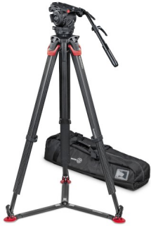
System Cine 7+7 FT GS