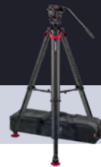
System aktiv8 flowtech75 GS S2068S-FTGS